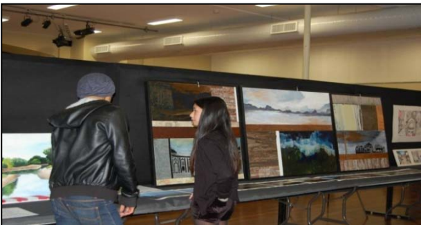
A section of Fred Si Ping Wu tranquil landscape and Sophie Quinn's Body of Work